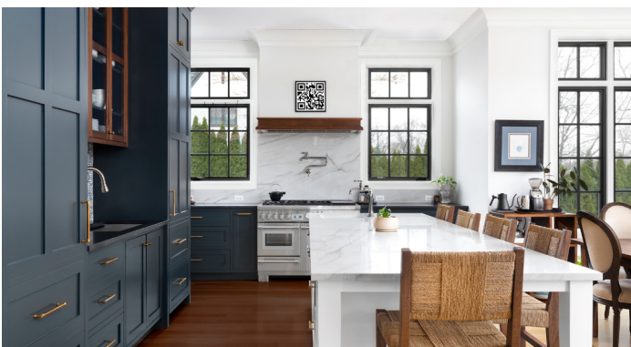
Full Room Interior Color Coordination Across Multiple Substrates