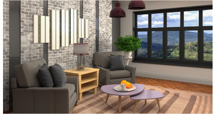
Interior, Exterior Lamination, Prefinished Paint & Stain Offerings