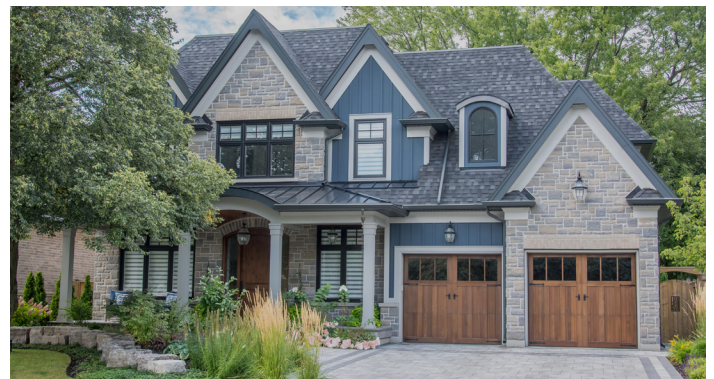
Multiple Complimentary Exterior Building Products Applications