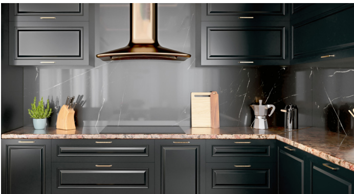
Thermofoil, Prime, Stain or Paint, Cabinetry & Moulding Components