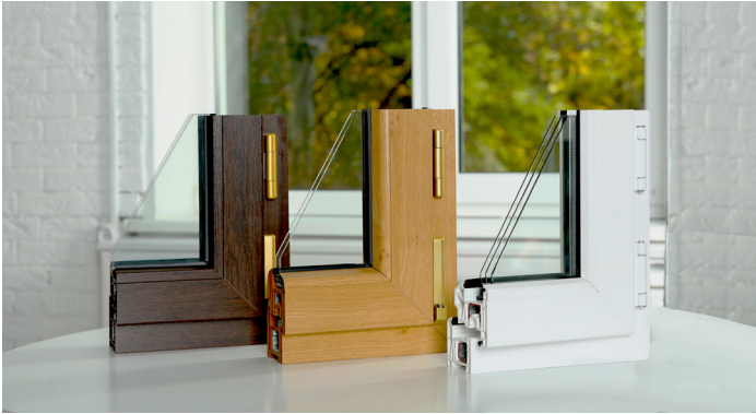
Window & Door Lamination

North American Specialty Laminations capabilities include laminated door and window profiles, wood and composite components for cabinet door and drawer fronts, drawer parts and boxes, furniture components, architectural mouldings, where we rip, mould, prime, stain and/ or wrap finish. In an array of interior and exterior building product applications across MDF, particle board, softwood, fiberglass, fire rated materials, composites, aluminum, vinyl and PVC substrates. NASL is the single color source solution provider to the building materials industry.